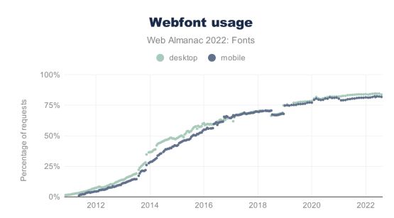
Figure 2: Webfont usage from Nov 15 2010 to Aug 1 2022 [5]

METAFONT also suffers from a complex syntax, in part due to the technological limitations placed on it by its implementation languages. Its reliance on symbols and short keywords can